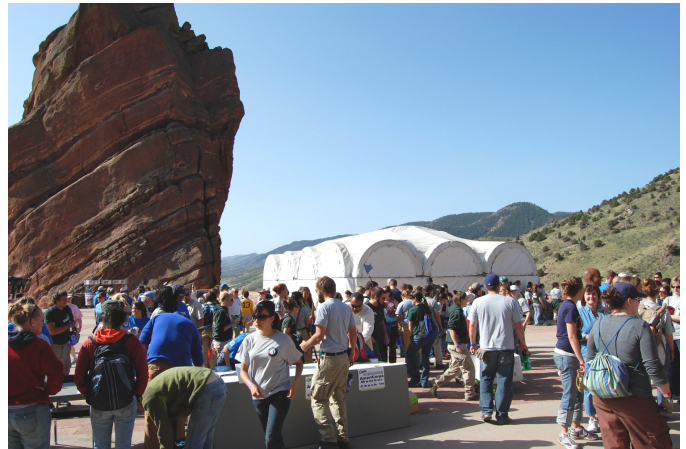
AmeriCorps Members from across Colorado joined together for a service project at Red Rocks during last year's AmeriCorps Week.

Along with the GCCS, the AmeriCorps Alumni Association is preparing to host their Life After AmeriCorps or "LAFTA" Conference during this special week. This year, they will combine their efforts and partner with the Colorado AmeriCorps*NCCC membership.