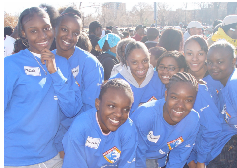
Many youth joined in on activities for the MLK Jr. Day of Service

In the Denver metro area, Kaiser Permanente sponsored several events including a Community Health Fair at Manual High School and a Youth Day at the Denver Broncos Boys and Girls Club. Fort Lewis College held a community march/parade and civil rights forum. In Estes Park, Eagle Rock School hosted the Estes Earth Fest which promotes and focuses on conservation and environmental care. The Day of Service proved as a great opportunity to help many.